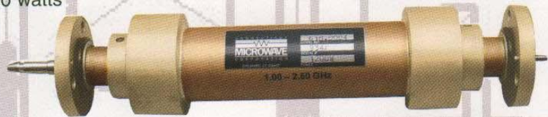
Low Pass Filter