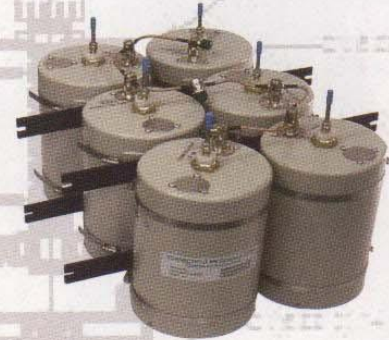
Band Pass Cavity Filter